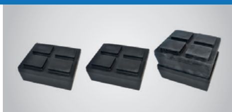
Stackable Interlocking Pads (1 set of 4) 1 Kit included in the scope of delivery