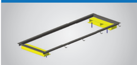
Flush Mount Kit